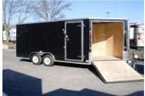
#13040 Scratch & Dent Price $6399