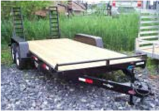
#12720 Equipment Trailer $2945

TRAILERS+PLUSS Quality Trailers for Work or Play