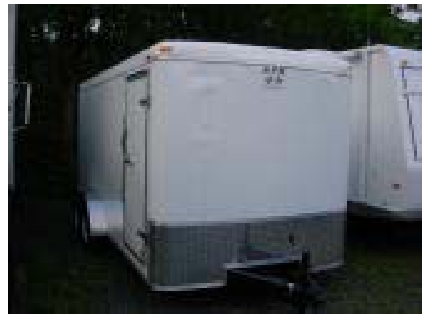
#13291 Scratch & Dent Price $4897

These Scratch & Dent Specials are a Limited Time Offer See Salesperson for Details