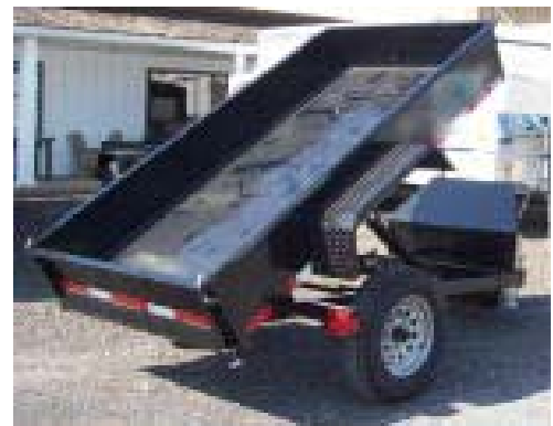
#12666 4x8 Dump Trailer $2895