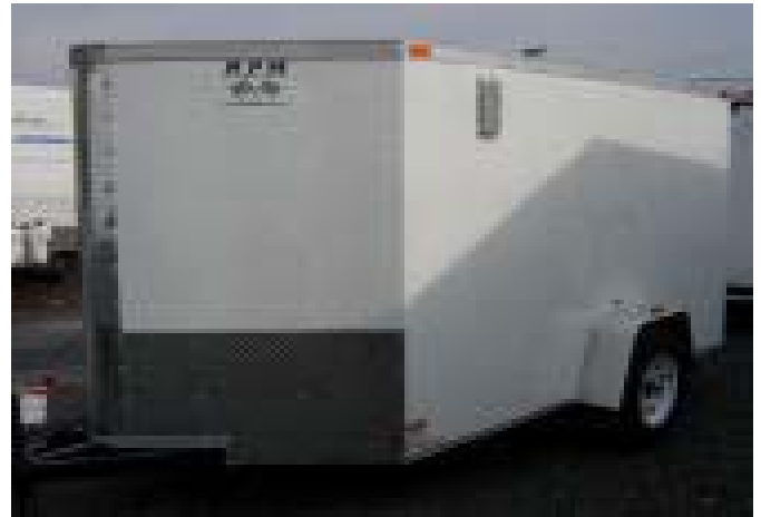
#13256 Motorcycle Trailer $3199.