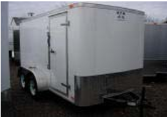
#13032 6x12TA Cargo Trailer $3289.