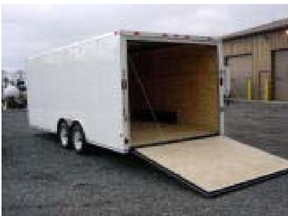
#13185 Scratch & Dent Price $5875