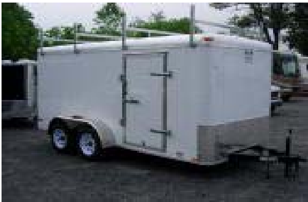
#13304 Scratch & Dent Price $4699