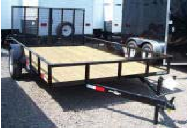
#12709 Landscape Trailer $1399.

TRAILERS+ PLUSS Quality Trailers for Work or Play